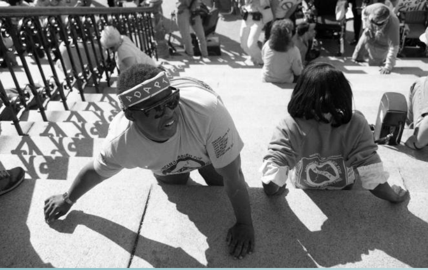
ADAPT activists drag themselves up the U.S. Capitol steps at the "Capitol Crawl" demonstration in Washington, D.C. on March 12, 1990. (Tom Olin)